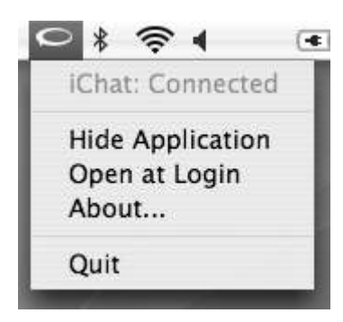
Figure 2.5 – Futiro Menu

When the Futiro software is running, the Futiro logo will appear in the menu bar (Figure 2.5).